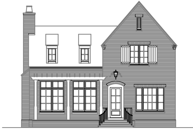
VILLAGE A - 90' FRONT ELEVATION