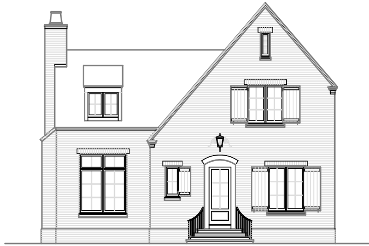
VILLAGE A – ALTERNATE FRONT ELEVATION