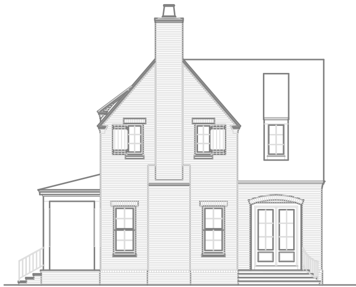
VILLAGE B FRONT ELEVATION