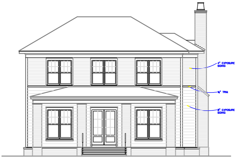
VILLAGE C - 90' FRONT ELEVATION